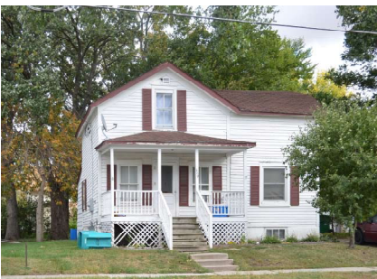
609 4th Street SW retains most of its 1865 charm with its original wood lap siding and original window and door placement.

A smaller residential area, referred to as the SouthWest Residential Survey area is located in the City's southwest neighborhood defined by 5 th Avenue SW to the north, the Dakota, Minnesota and Eastern/Canadian Pacific rail line to the east, 7 th Avenue SW to the south and 7 th Street SW to the west. This area is composed of approximately 90 homes ranging in date of construction from an 1878 Homestead “cottage” design at 609 4th Street SW to a circa 1995 split-level house at 613 6th Avenue SW.