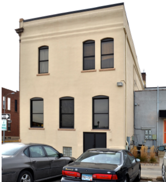
Back elevation looking to the west/southwest