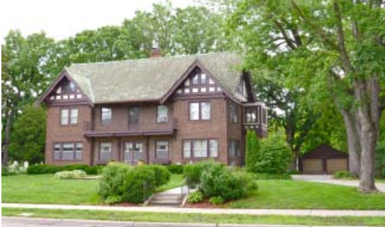
Built in 1916, the Moonan/Driessen House at 610 State Street North is a Tudor Revival Mansion that retains good integrity and is in very good condition.

The North Residential Survey area is made up of approximately 54 homes ranging in age from an 1868 structure at 511 State Street North to the 1990 modern home at 600 State Street North.