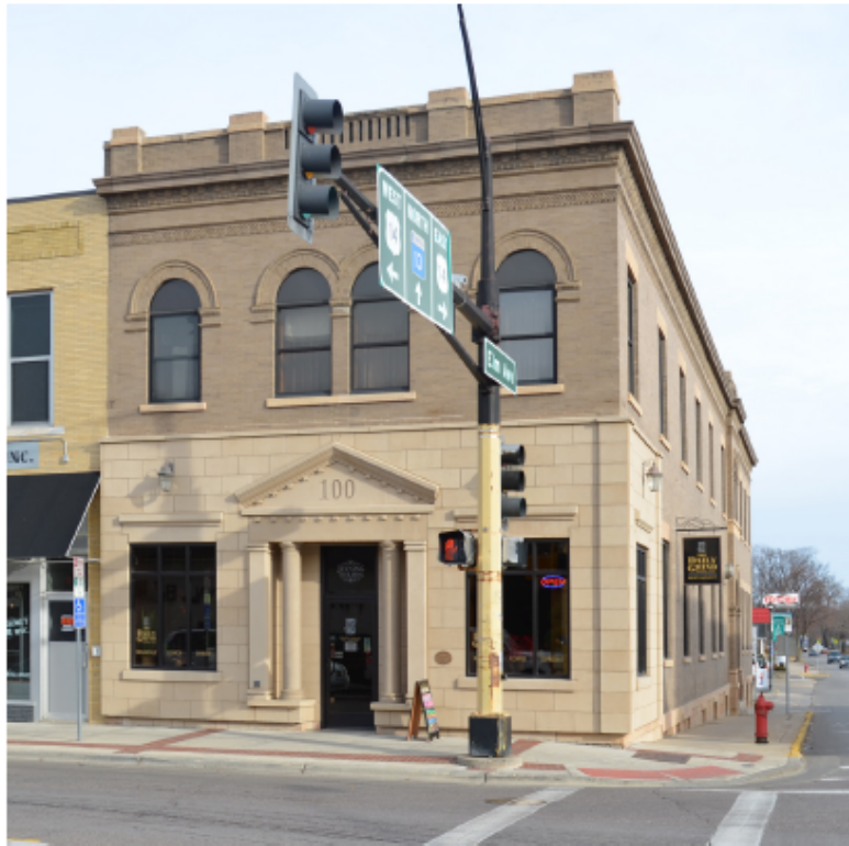
Front elevation along State Street North looking to the east/northeast