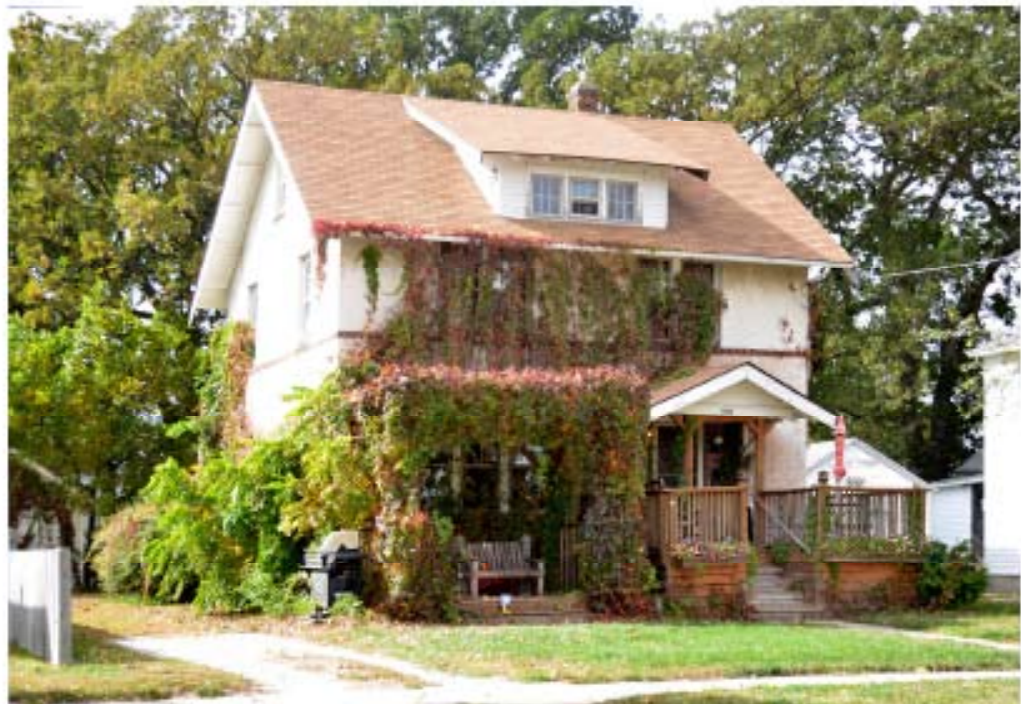
View looking west

State Historic Context Railroads and Agricultural Development, 1870-1940 Local Historic Context City of Waseca Context 8—Residential—1867-1960s Date Constructed 1920 Historic Name Unknown Style Craftsman Description Early 20th-century 2½-story Craftsman with end gables and original fenestration; sheathed in stucco/decorative brickwork. Altered entry porch. Detached garage to south/back of house. Integrity Good Condition Good Property Type Building Historic Use Residential Present Use Residential NR Status Not Listed NR Recommendation Merits further research due to architectural integrity. References City of Waseca Historic Context Study, Spring 2010 Waseca County Historical Society survey files, 2011-12 Waseca County Assessor tax records, 2012