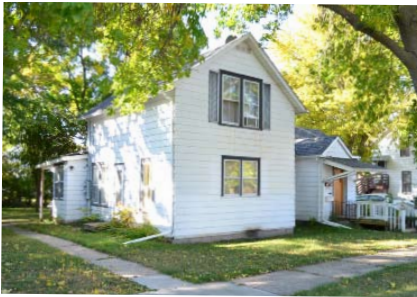
While 614 3rd Avenue SE, believed built in 1865, may be the oldest remaining home in the East Residential Survey area, it has lost much of its original appearance with “down-sized” modern windows, a modified entry and artificial siding.

The larger residential district, referred to as the East Residential Survey area, is defined by the downtown district to the west, the center line of 4th Avenue NE to the north, 5 th Avenue SE to the south and 12 th Street SE to the east. It is composed of approximately 520 properties ranging in construction dates from 1865 (614 3rd Avenue SE) to as recent as 2008 (615 2nd Avenue NE).