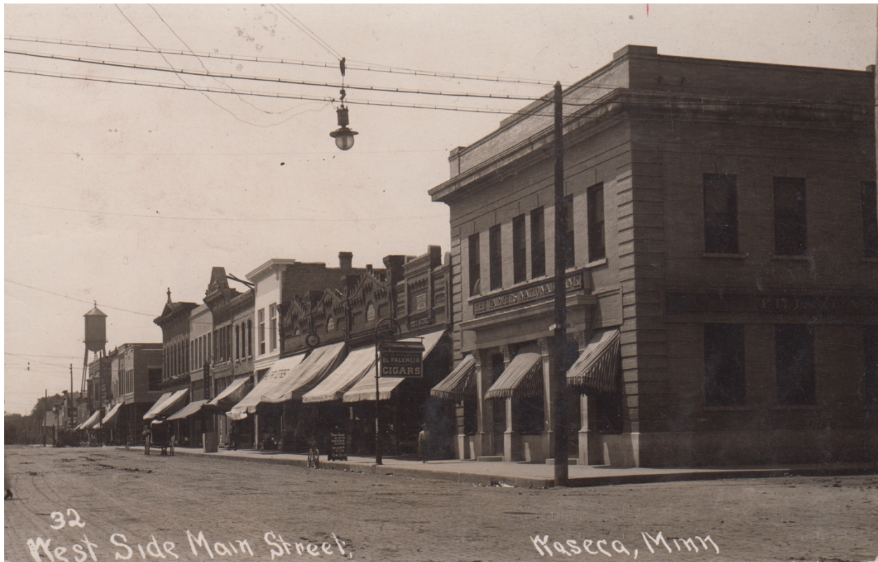
1912 – Farmers National Bank is on the corner. Great photo showing the west side of Waseca's main street at this time. Awnings have been added to several windows.