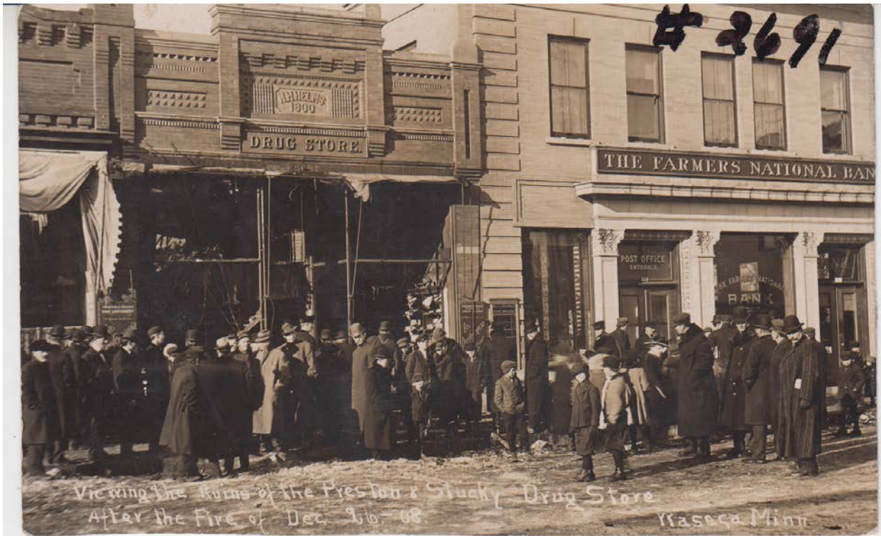
1908 – Postcard depicting the aftermath of a fire at Preston & Stucky Drug Store. You can see the Farmer’s National Bank building next to the drug store. The façade of this building is minimally unchanged since it was built in 1906. Also visible is the entrance to the Waseca Post Office.