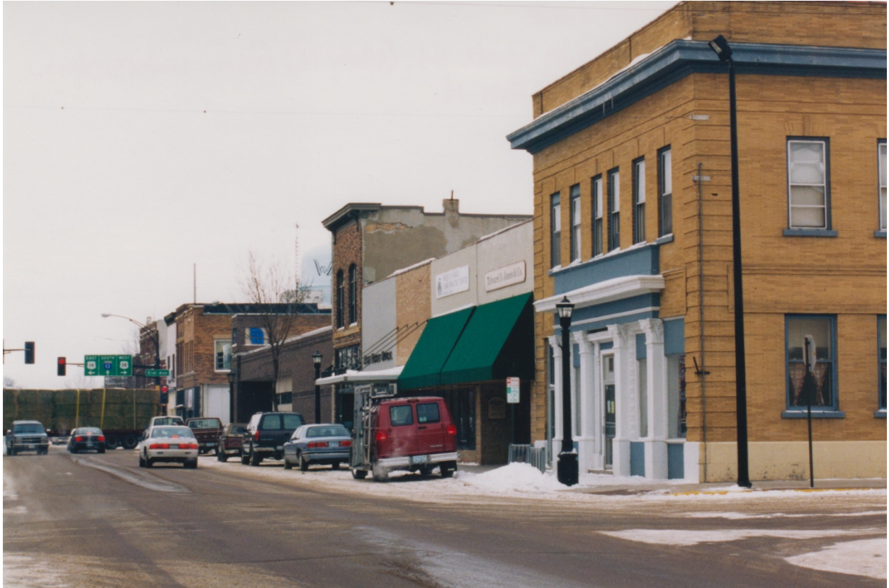
1998 – Looking south on State Street towards Elm Ave. The building appears unoccupied at this period.