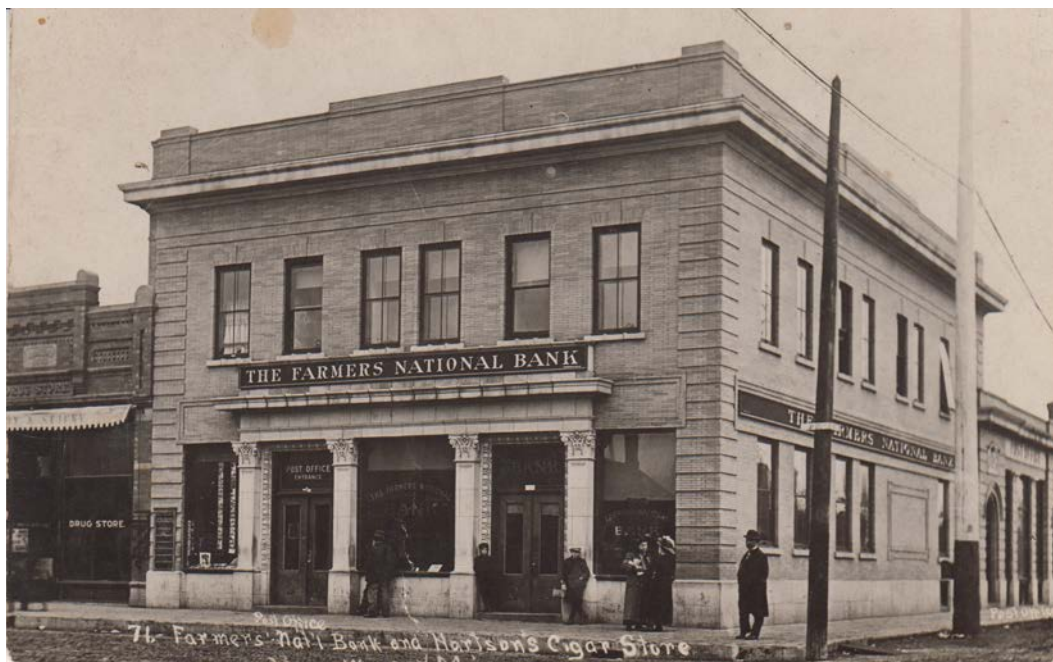
Circa 1915 – A great photo showing the style of the building as well as the entrance to the bank and the separate entrance to the Post Office. The window awnings have been removed.