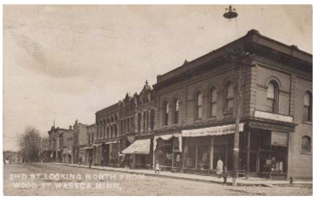
1913 – JJ Coleman Furniture Store