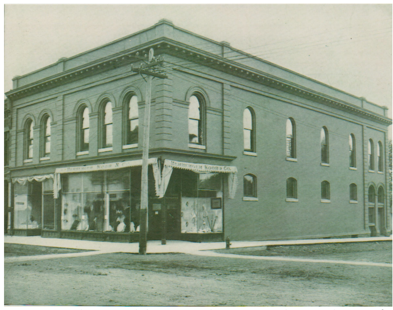
Circa 1900 – Herberger, Koob & Co. Drygoods store – Note the corner location of the entry-door