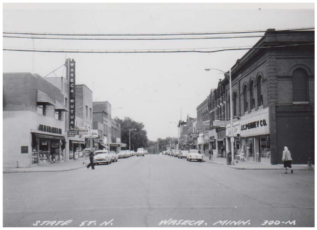
1955 J.C. Penney Co. – Note that Penney's moved the entry-door to the middle of the State Street façade.